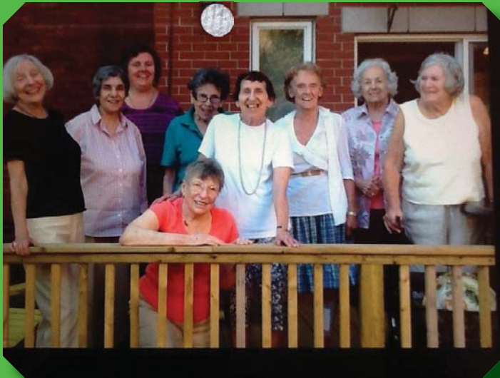
Abbeyfield residents enjoying their new deck

Habitat NCR's ReNew It Project was supported by OakWood Renovation Experts, BOMA Ottawa and the RBC Foundation