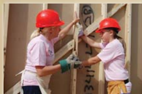
2007: First NCR Women Build