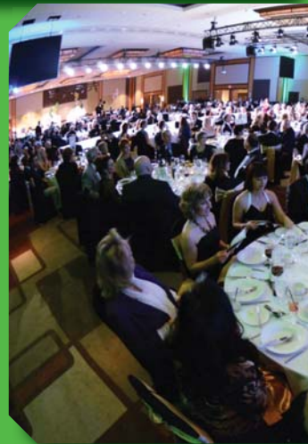
Thank you to all who attended