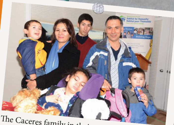
The Caceres family in their new home