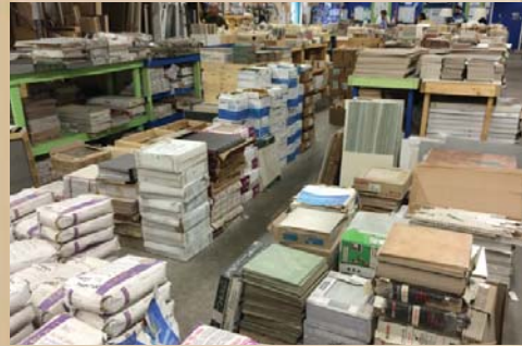
1997: First ReStore location