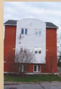
1994: First Habitat NCR Home