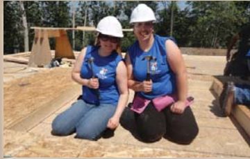
2011: First build in Carleton Place