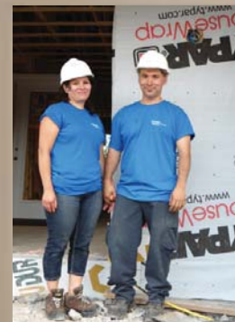
2013: First barrier-free floor plan