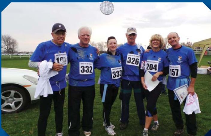
Build Committee members/zombie survivors

In its first year, the Zombie Run for Humanity was a huge success! 250 runners and zombies came together at the Nepean Equestrian Park on October 16th to raise over $6,500 for Habitat NCR. Our Build Committee volunteers worked hard to help the organizers build the course obstacles, and still had the energy to participate in the 5km run! The 2014 date is already set and we look forward to watching this event grow over the coming years.