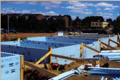
2002: First multi-unit build